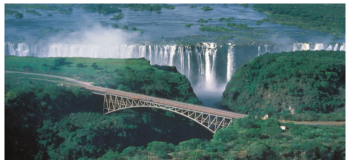
Visit and tour the Victoria falls in Livingstone, Zambia!

Social Support: Supporting the poor, needy and vulnerable in Africa. EGD is dedicated to making a positive impact on communities in need. We initiate and support projects aimed at improving the lives of the needy and vulnerable across Africa. In the past recent years the world has seen the massive immigrations by the African youth that take risks by crossing the seas for a better life in Europe. Usually, such journeys find these youths trapped in these seas! Our company is here to raise finances and materials to support the African youth locally through affordable education and learn skills that will make them become entrepreneurs right in their home countries.