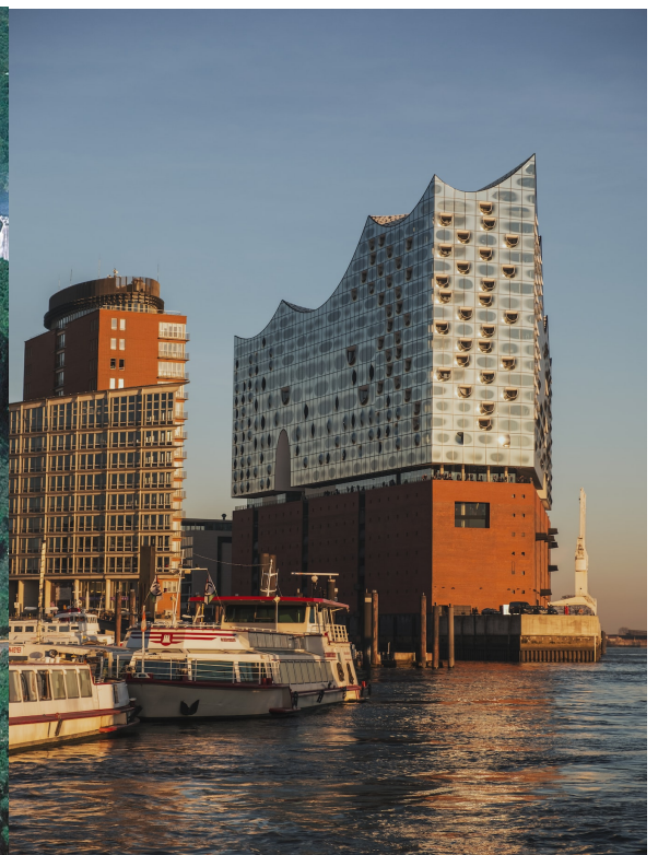
„Tour the Victoria falls in Livingstone, Zambia and enjoy entertainment at the Elbphilharmonie, Hamburg, Germany“