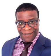
E-Lukomona CEO & President